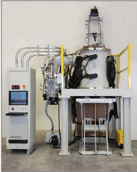
Model K1 Sapphire Crystal Grower