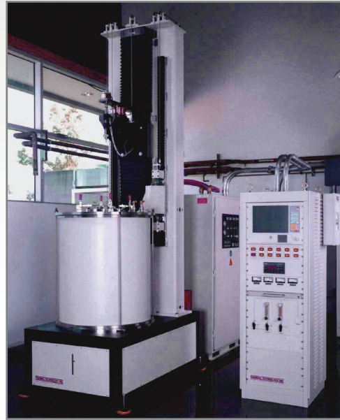
Czochralski Crystal Growing System