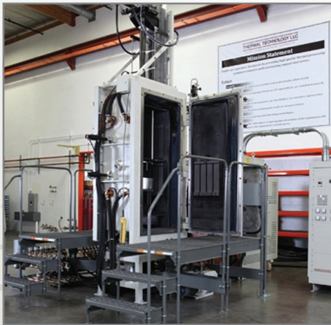
EFG Crystal Growing System