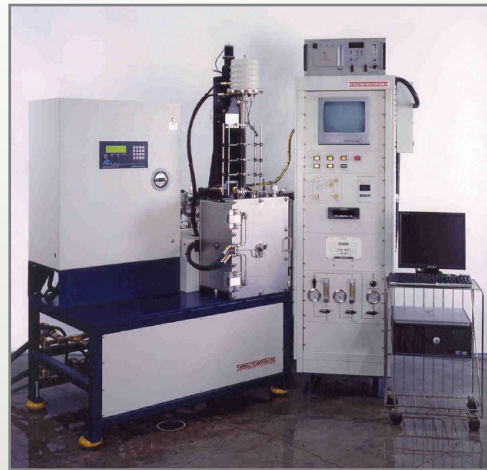
Czochralski Crystal Growing System